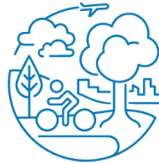
Improve public spaces